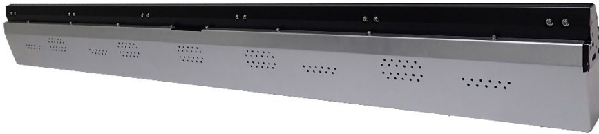
KD6R1064CXF-NL model in new KD-CXF series

Achieves industry's deepest depth of field; ideal for inspecting surfaces of diverse objects in production