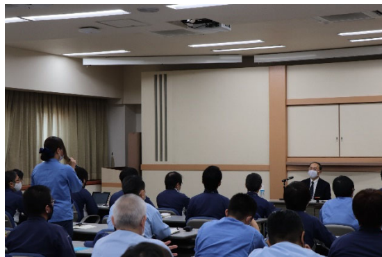
◇ Power Distribution Systems Center (October 6, 2021)