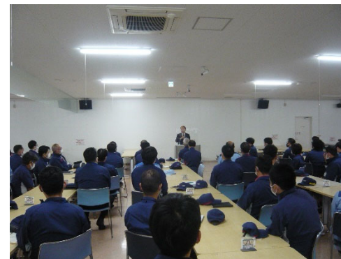
◇ Sanda Works (October 27, 2021)