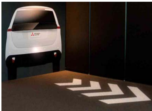
Reverse indicator with illuminating road surfaces

TOKYO, October 10, 2017 – Mitsubishi Electric Corporation (TOKYO: 6503) announced today its new Safe and Secure Lighting system, which uses road-surface projections and car-body displays to inform pedestrians and other drivers about the vehicle's movements and actions. Selected features of the system will be exhibited with the Mitsubishi Electric EMIRAI4 concept car during 45th Tokyo Motor Show 2017, which will take place at the Tokyo Big Sight exhibition complex in Tokyo, Japan from October 27 to November 5.