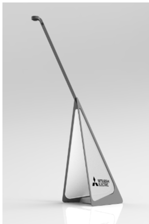
Wireless surveillance camera

TOKYO, January 28, 2015 – Mitsubishi Electric Corporation (TOKYO: 6503) has developed a wireless network system for surveillance cameras that uses multihop technology to enable users to set up a network simply by connecting the wireless cameras using visualization software, without any need for power cords or a wired LAN.